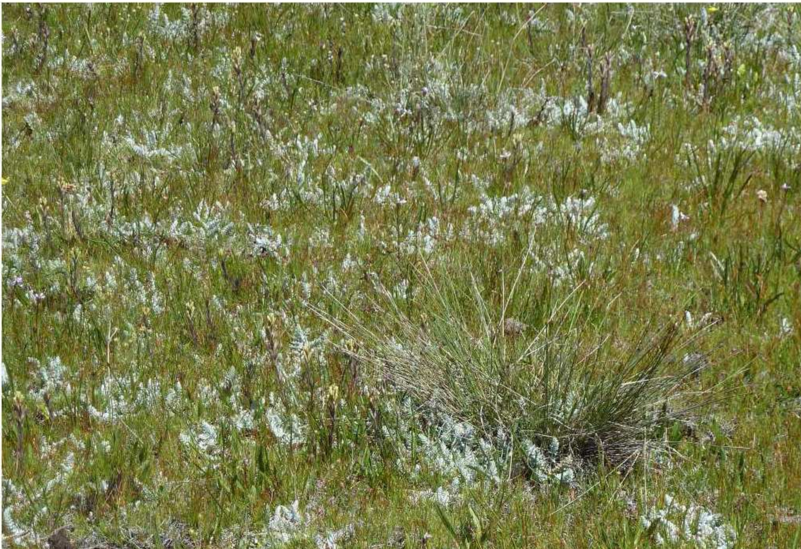
Figure 6. Habitat of Castilleja collegiorum , Big Meadows, 15 Jul 2013. The silvery-leaved plant is Potentilla breweri , a frequent associate of C. collegiorum .

Castilleja collegiorum has been observed in flower from 6 July to 26 July. The timing and duration of flowering likely vary annually depending on the depth and persistence of the snowpack and the amount of ponding in the meadows. No potential pollinators, either avian or insect, were noted visiting the flowers of C. collegiorum in the field, and we observed little if any evidence of predation on the plants by animals of any sort.